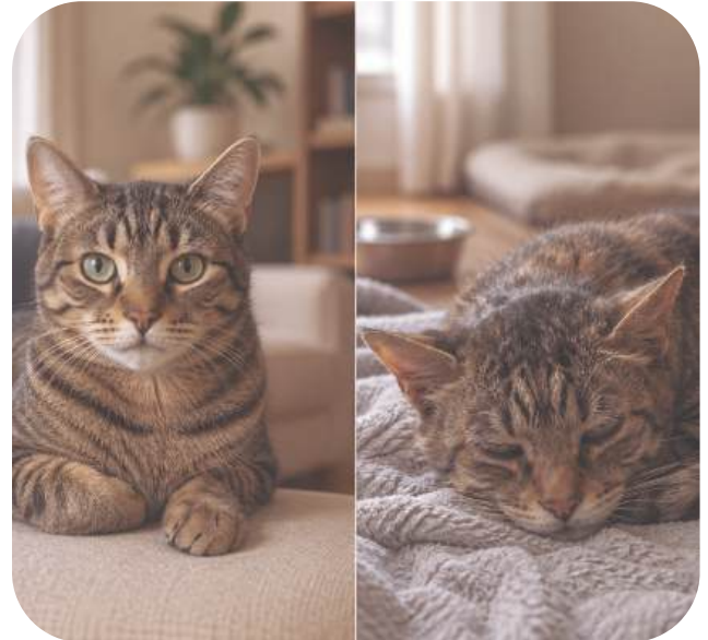
Healthy behavior on the left, sick behavior on the right.